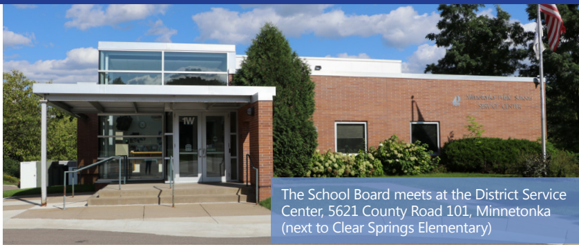
The School Board meets at the District Service Center, 5621 County Road 101, Minnetonka (next to Clear Springs Elementary)