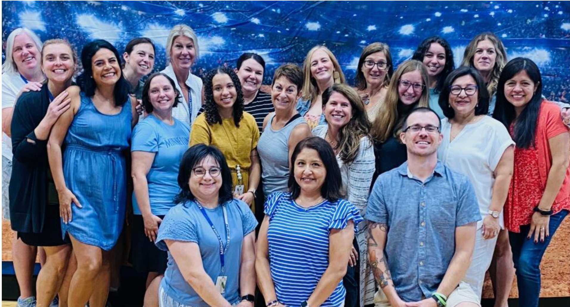
Minnewashta Kindergarten Staff